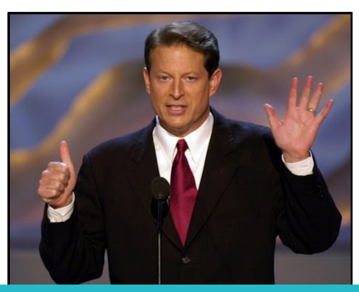
international-graffiti.com p. 2/4

Comparison : Both Gore and Harris have strong legislative backgrounds. Gore's focus on environmental issues parallels Harris's initiatives in environmental justice, while her criminal justice reform efforts offer a distinctive area of expertise [9].